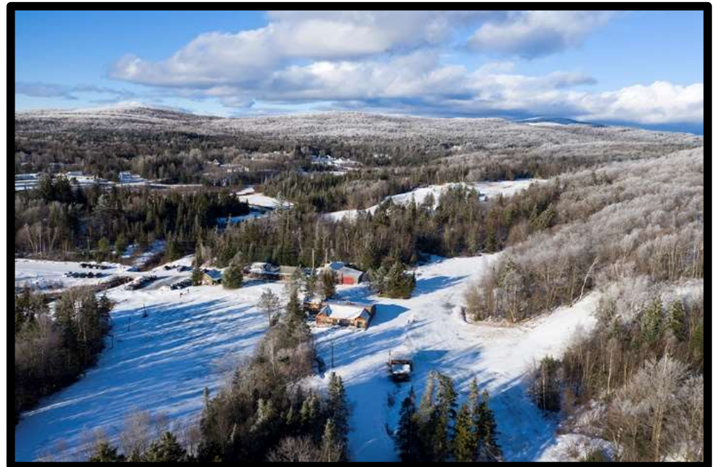
Prospect Mountain Nordic Ski Area in Woodford