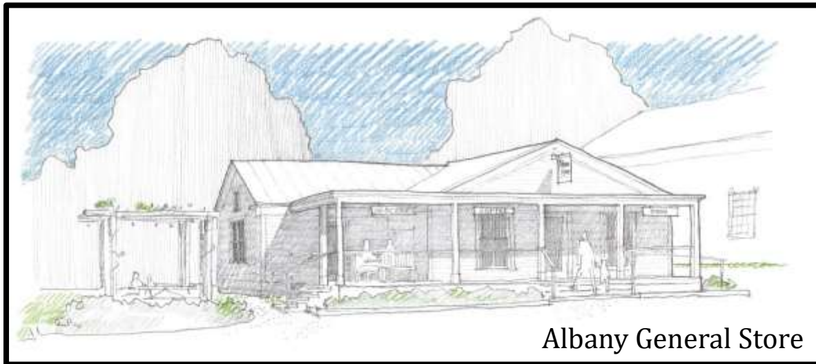
Albany General Store

Act 194 of 2017 directed VHCB to create a Rural Economic Development Initiative. Using $75,000 for grant-writing services, the Viability Program helped 10 rural enterprises and small towns secure $1.78 million in grants from federal, philanthropic and state sources.